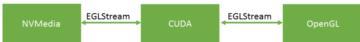
Figure 3 EGLStream Pipeline

The EGLStream pipeline is illustrated in Figure 3.